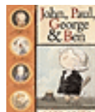
John, Paul, George, and Ben by Lane Smith