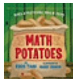
Math Potatoes by Greg Tang