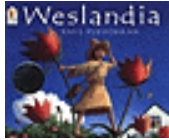
Weslandia by Paul Fleischman