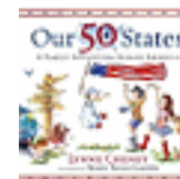
Our 50 States by Lynne Cheney