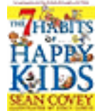
The Seven Habits of Happy Kids by Sean Covey