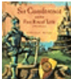
Sir Cumference and the First Round Table by Cindy Neuschwander